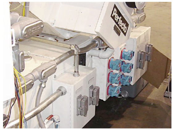
Switch rated Decontactor receptacles are used to connect power from a shell press to auxiliary equipment.

Many of the machines have multiple connections. One End System press, for example, has four blowers equipped with the Decontactors. Harmon says the ability to differentiate them makes connections faster and safer. "We can rotate them to 24 different points, so we can key them to their mate, That way the operator can get the phasing right on all the plugs every time."