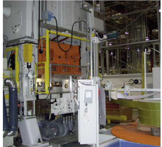
Power to the uncoiler in front of this Stolle Cupping System can be disconnected easily for die changing or maintenance, using the Meltric Deconnector visible above the die on the left side of the machine.