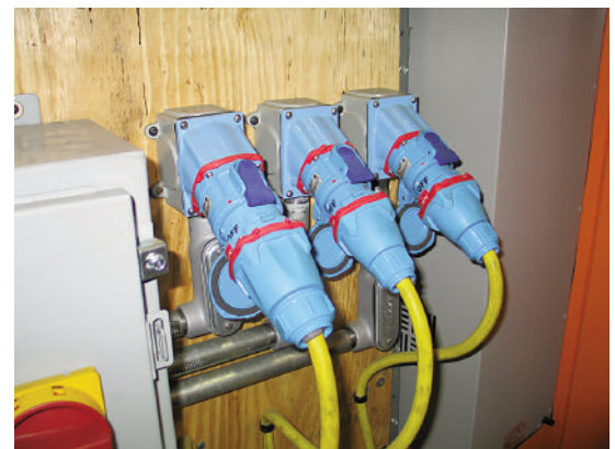
Typical load station in Stolle plant is equipped with multiple Decontactors to facilitate testing and customer runoff of new machinery.