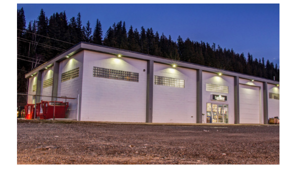
Flat Panel Lighting