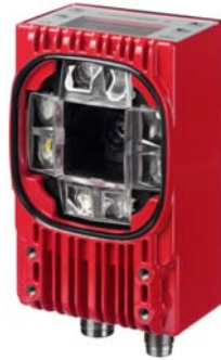
Figure 2. All necessary components are integrated in the compact housing of the LSIS 400 i smart camera – from the illumination to image processing, the image and program memory, the display and result display and even the interfaces.