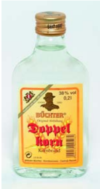
Figure 1. The clear liquids in pocket bottles pose a big challenge during bottle inspection. Labels, fill levels and caps are inspected with LSIS 412 i smart cameras from Leuze electronic.