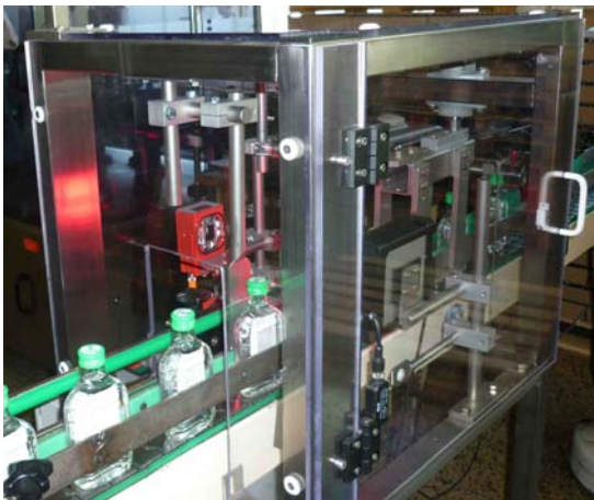
Figure 3. The LSIS 412 i smart camera from Leuze electronic is predestined for inspection tasks in the bottle inspector from Küppersbusch.