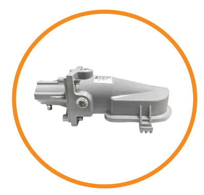
34mm Slip-fit Pole Mount HZXCV34