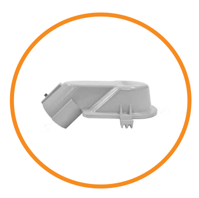
45° Stanchion Mount HZXS45