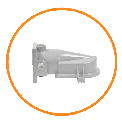
Wall Mount HZXW01