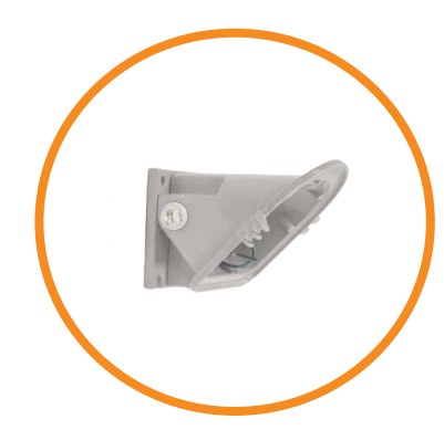
45° Wall Mount HZXW45